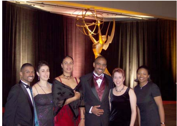
Sphinx Staff help DPTV celebrate the Emmy Award-winning documentary at the 26th Annual Michigan Chapter Emmy Awards