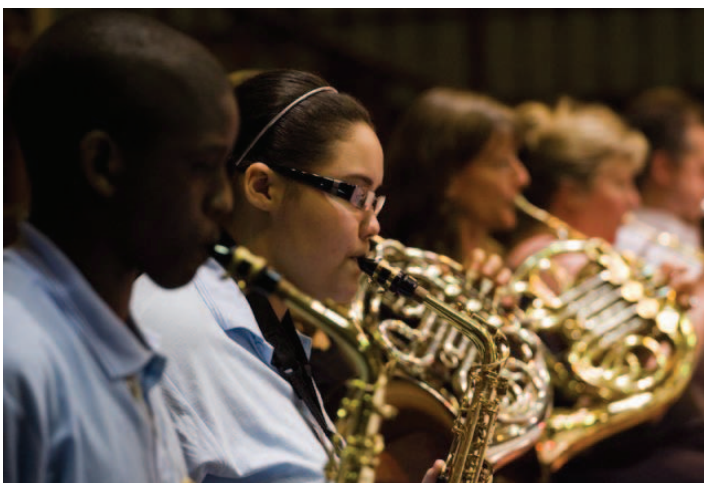
Education is a key component of the KwaZulu-Natal Philharmonic Orchestra's programming. This South African orchestra is a new partner in the Sphinx Professional Development Program