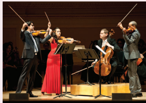
The Catalyst Quartet performs at Carnegie Hall.