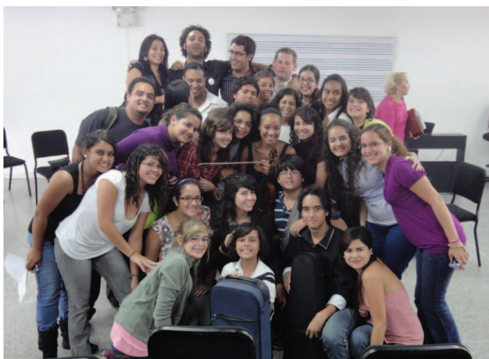
The Harlem Quartet masterclass in Venezuela May 24, 2010