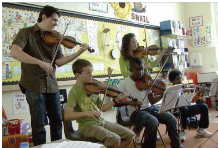
The Catalyst Quartet in residency at Wyvil Primary School, London, July 2010